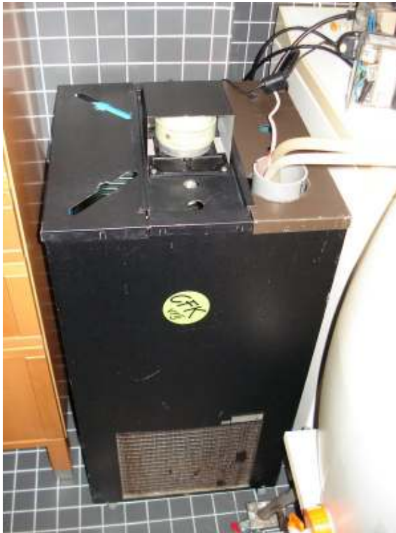
Figure 1, The water cooler

I have a water cooler, as they are used in bars for draught beer. I have bought it on one of those 'second hand' websites. This cooler is just like a refrigerator, but it makes cold water. It holds 40 liters ( US gallons).