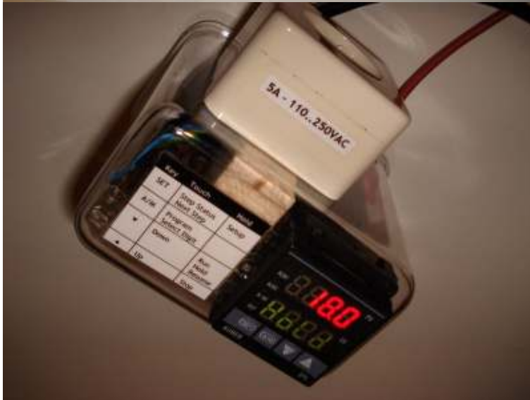
Figure 3, 'The Tube' with PT100 sensor in rubber stopper

In order to control fermentation temperature, I circulate the cold water through a stainless steel spiraled pipe which is in the beer fermentation vessel. The cold water is pumped by a small 12VDC immersion pump. To keep the pump at a fixed location in the cooler water reservoir, I have created 'the tube'. You can see the tube on the pictures. It contains the PT100 to measure the water temperature sensor (reddish wire and steel stub sticking out of the grey rubber stopper) and the immersion pump and it's in- and out-hoses and 12V power cable (white). You can see how the out-hose comes out the bottom, to ensure mixing water temperature. I created a mesh in the tube as a platform to stand the pump on. The holes in the tube provide for the entry of water.