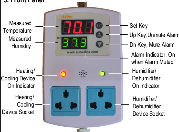
Figure 1. Front Panel