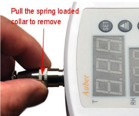
Figure 4. Remove the Sensor