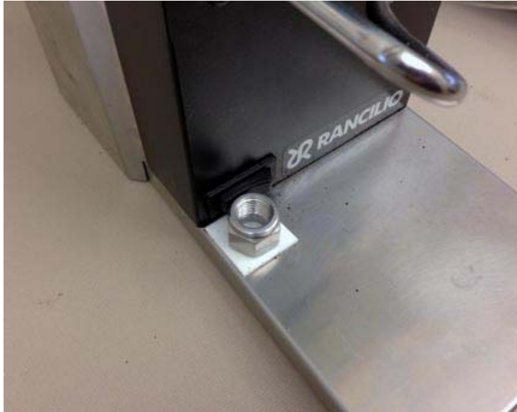
Figure 1, a simple way to hold the push and hold switch of Rocky at the on position. A screw nut is held in place by a double sided tape.

You need to keep the "push and hold switch" at the on position. One easy way is to use a double sided tape to hold a solid block against the switch. The solid block is preferably about 1 inch cubic size. If it is too small, there will not be enough surface for secure adhesion. If it is too large, it may get into the operation. The block can be made of steel or wood as long as it has good adhesion with the tape.