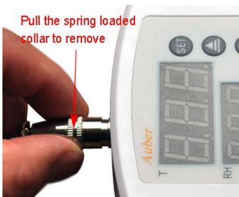
Figure 4. Remove the Sensor