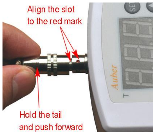
Figure 3. Install the Sensor

the female connector on the sensor to the red mark of the male connector on the unit, then hold the tail and push the female connector forward. To remove the connector, please pull the spring loaded collar of the female connector. Please see the Figure 3 and Figure 4 below for details.