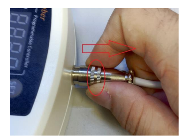
Figure 4. Remove the sensor.

Auber Instruments Inc. 5755 North Point Parkway, Suite 99, Alpharetta, GA 30022 www.auberins.com E-mail: info@auberins.com Tel: 770-569-8420