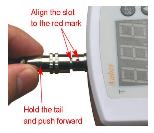
Figure 3. Install the Sensor

The connector of sensor contains a slot for correct pin connection. It also has a spring lock to prevent disconnections from accidental pulling on the cable. To install the to the unit, please align the slot of the female connector on the sensor to the red mark of the male connector on the unit, then hold the tail and push the female connector forward. To remove the connector, please pull the spring loaded collar of the female connector. Please see the Figure 3 and Figure 4 below for details.