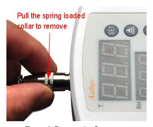
Figure 4. Remove the Sensor