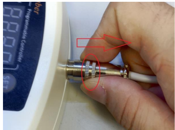
Figure 4. Remove the sensor.