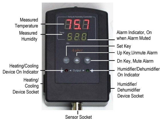
Figure 1. Front Panel

Measured temperature window: In normal operating mode, this window shows measured temperature. In parameter setting mode, this window shows parameter name.