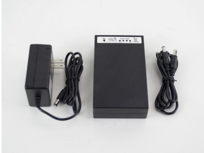
Figure 1. Package list (from left to right): Power adapter, Battery Pack, Output cable for SYL-1615